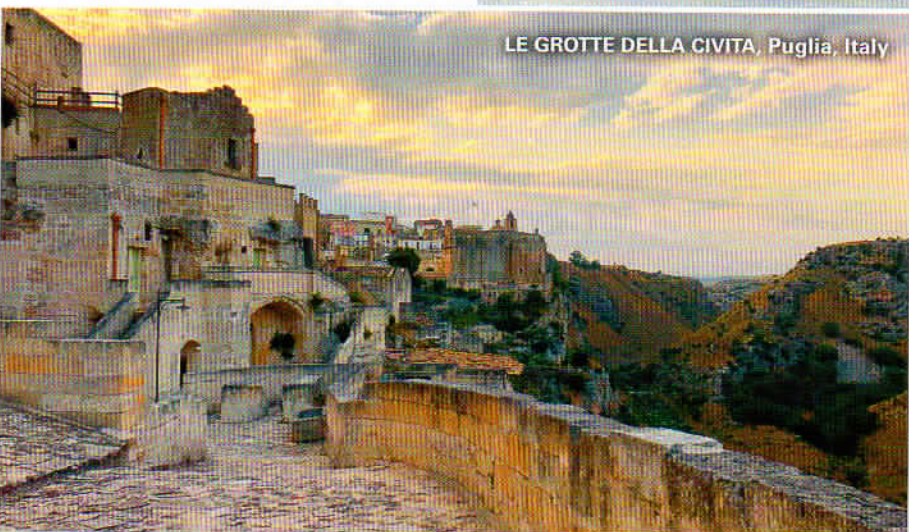
LE GROTTE DELLA CIVITA, Puglia, Italy